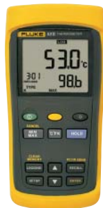
Fluke 53 II