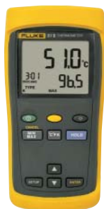
Fluke 51 II