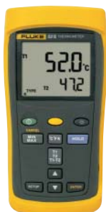
Fluke 52 II