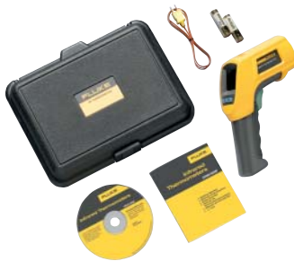
The Fluke 566 and included accessories