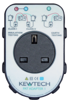
PAT Adaptor 1