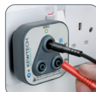
For ring mains testing