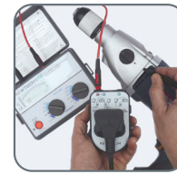
Class I insulation