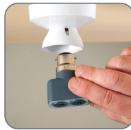
Plug in Lightmate