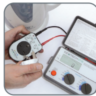
Class II insulation