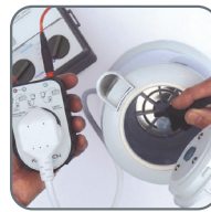
Class I earth bond