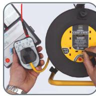
Extension lead testing