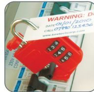
Fits most toggle switch MCBs and main switches