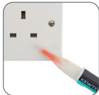
Non contact voltage detection