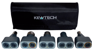
Lightmates (BC, ES, GU10, SBC & SES)