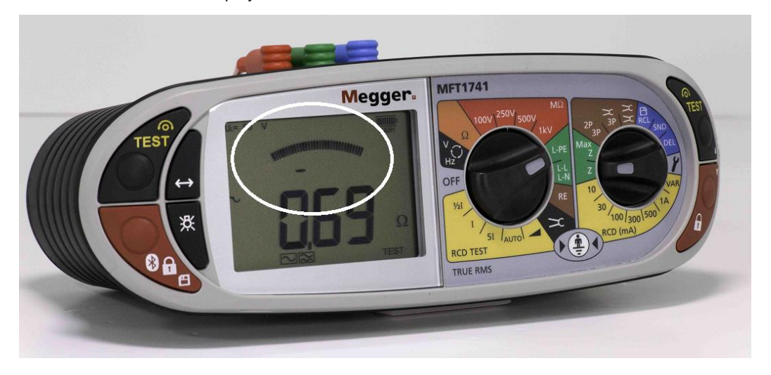
Figure 1. Instrument with arc encircled.

The display shows a full width analogue arc, consisting of 51 elements, refer to Figure 1. At the start of the test all elements are displayed.